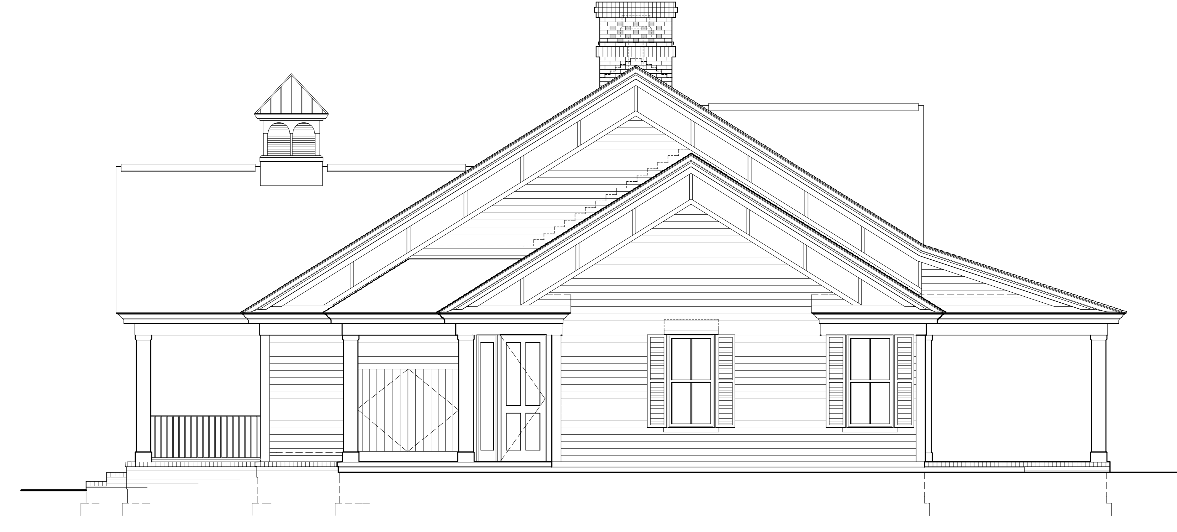
2 RIGHT SIDE ELEVATION SK-2 SCALE: 1/4" = 1'-0"