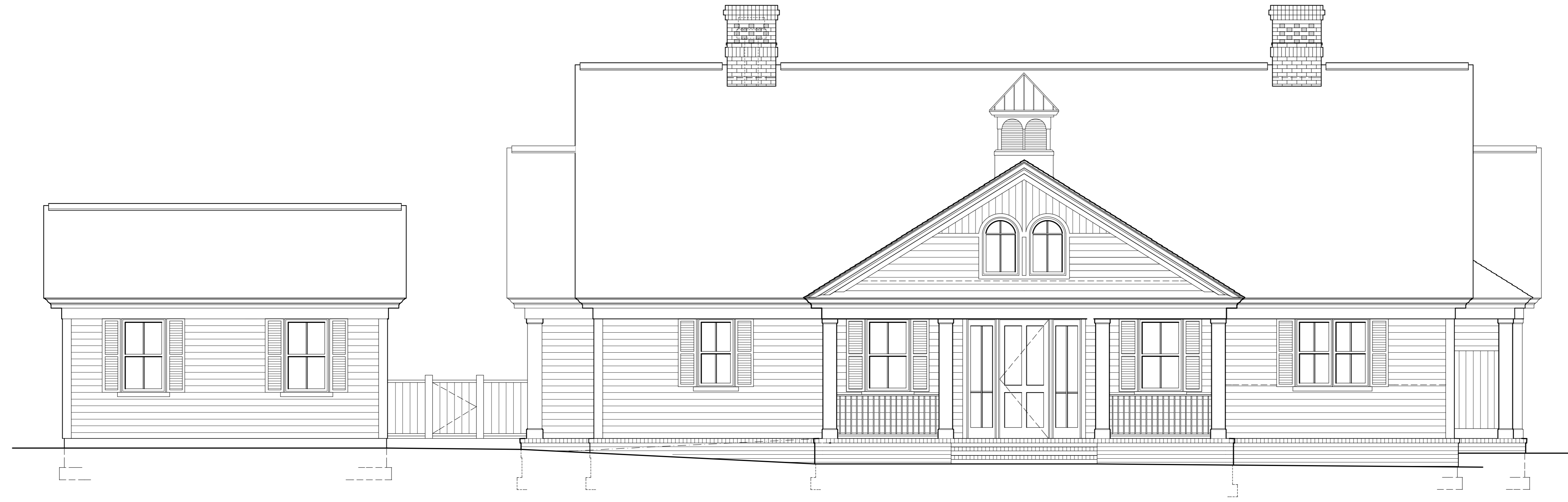
1 FRONT ELEVATION SK-2 SCALE: 1/4" = 1'-0"